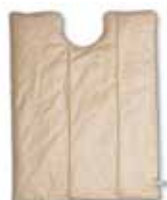
Size 30 28.7" W × 35.5" L (72.9 × 90.2 cm)