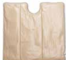
Size 31 38.7" W × 35.5" L (98.3 × 90.2 cm)