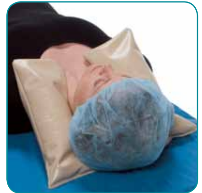
Neck Support. The Size 11 Vac-Pac and its U-shape cutout supports the patient's neck while keeping the respiratory area accessible.