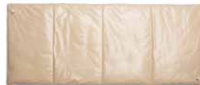
Size 40 30" W × 76" L (76.2 × 193.1 cm)

Any Vacuum Source. Use OR wall suction, aspirator pumps, or any other convenient vacuum source.