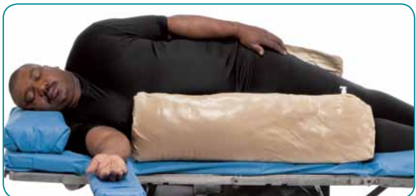
Lateral Position. Vac-Pacs keep the patient in place while providing full access to the surgical site. Ideal for surgery requiring lateral position, such as hip or shoulder procedures, thoracotomy, nephrectomy, liposuction, circumferential/banded lipectomy, and others.