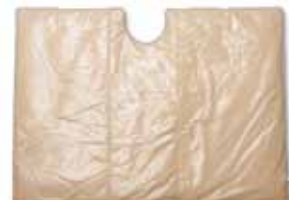
Size 32 46.7" W × 35.5" L (118.6 × 90.2 cm)