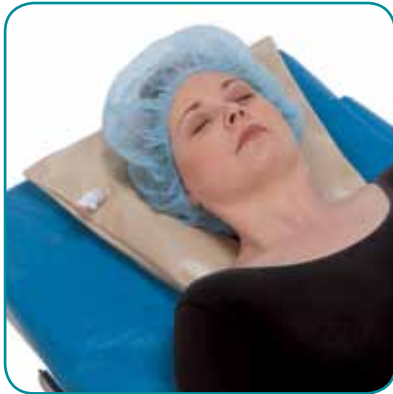
Head Immobilization. The Size 11 Vac-Pac provides stability to the head and facial region during plastic and ophthalmic surgeries.