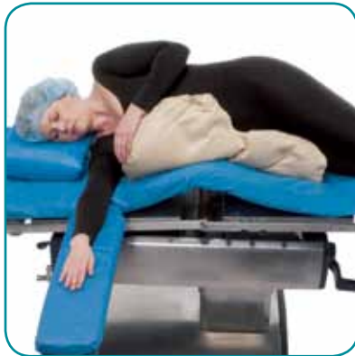
Kidney Position. Vac-Pacs stabilize the patient on an articulated table, and Vac-Pacs can be quickly reformed after table adjustments.