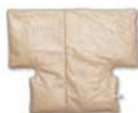
Size 35 34.5" W × 28" L (87.6 × 71.1 cm)