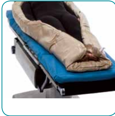
Full Body Support. The Size 40 Vac-Pac provides comfortable, full body support. Ideal for procedures requiring conscious sedation.