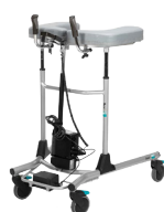
Bure™ StandTall Walkers

Bure Rise & Go is an all-round solution that saves space, time and money. Instead of purchasing both hoists and walkers it is probably often sufficient to acquire the flexible, cost effective Bure Rise & Go .