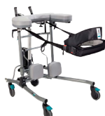
Bure™ Rise & Go™

Bure Rise & Go is an all-round solution that saves space, time and money. Instead of purchasing both hoists and walkers it is probably often sufficient to acquire the flexible, cost effective Bure Rise & Go .