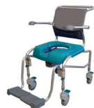
Amfibi™ Basic Hygiene Commode

Amfibi Basic was developed to meet most basic needs. With its attractive price it provides a lot of hygiene chair at low cost. Basic has adjustable seat height and a wide range of accessories that make it easy to individually adapt the chair to suit every patient's needs.