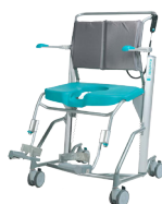
Amfibi™ XL Hygiene Commode

Amfibi Basic was developed to meet most basic needs. With its attractive price it provides a lot of hygiene chair at low cost. Basic has adjustable seat height and a wide range of accessories that make it easy to individually adapt the chair to suit every patient's needs.