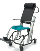
Amfibi™ Double Hygiene Commode

Amfibi Double HighBack is a further development of our much appreciated Amfibi concept. It is equipped with a high, upholstered back with upholstered back including neck rest and integrated seat with rear opening.