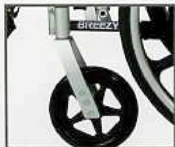
Angle-Adjustable Front Casters Accommodate angled seating surfaces without moving the caster housings out of square.