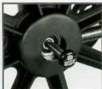
Quick-Release Wheels Make loading in/out of vehicles easy.