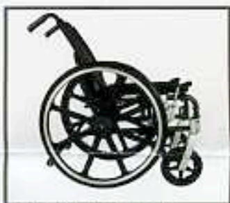
Angle-Adjustable Back Back adjusts from 6° anterior to 24° posterior in 6° increments for better positioning. Height adjusts to 17", 18" or 19".