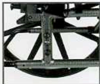
Adjustable Axle Positions Three seat height positions and the ability to add a fixed tilt allow for greater flexibility.