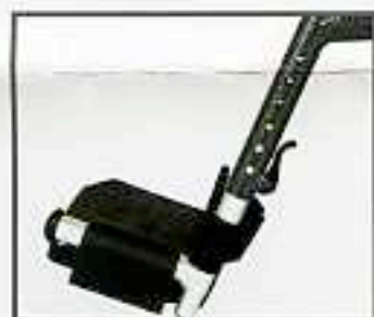
Quick-Adjust Footrests Adjust height without tools using spring-loaded detent buttons. Heel loops adjust with Velcro ®