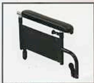
Height-Adjustable Arms 4" vertical adjustment allows for use of cushions.