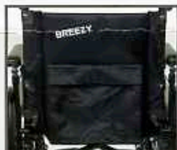
Height-Adjustable Back with Pocket Store personal items/documents in pocket with closing flap. Adjust height easily without tools.