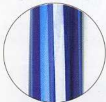
Stripes with blue handle