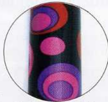
Circles with black handle

Note: 'Waves' & 'Mosaic' only available in 'Simple' up to 80Kg. All other designs available in both 'Simple' and 'Luxury' - up to 100Kg. Plain colours, shorter & extra long sticks available on request.