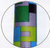
Mosaic with green handle